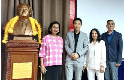
Ultra Sound Committee