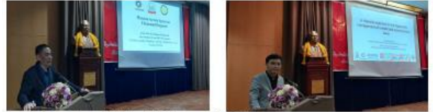
Image 3: The speakers giving introduction to some of their lectures