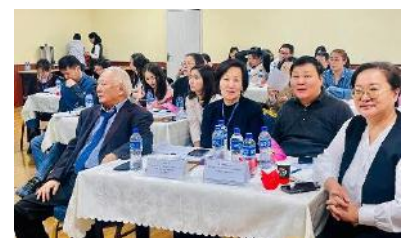
Member Society Corner