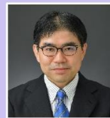
Message from JOGR