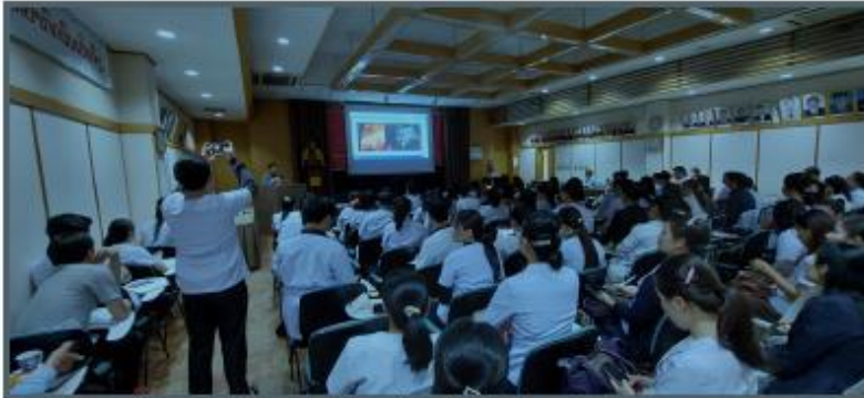
Image 1: A really encouraging turn out from the enthusiastic participants