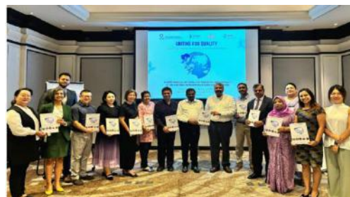
YGAA & MFM Committee